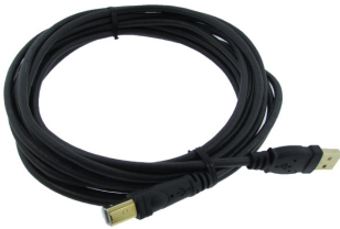
(1) USB Cable