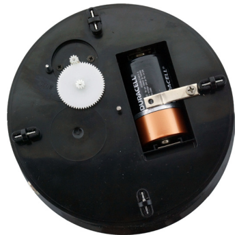
Gear on fast position