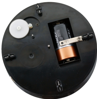
Gear on slow position